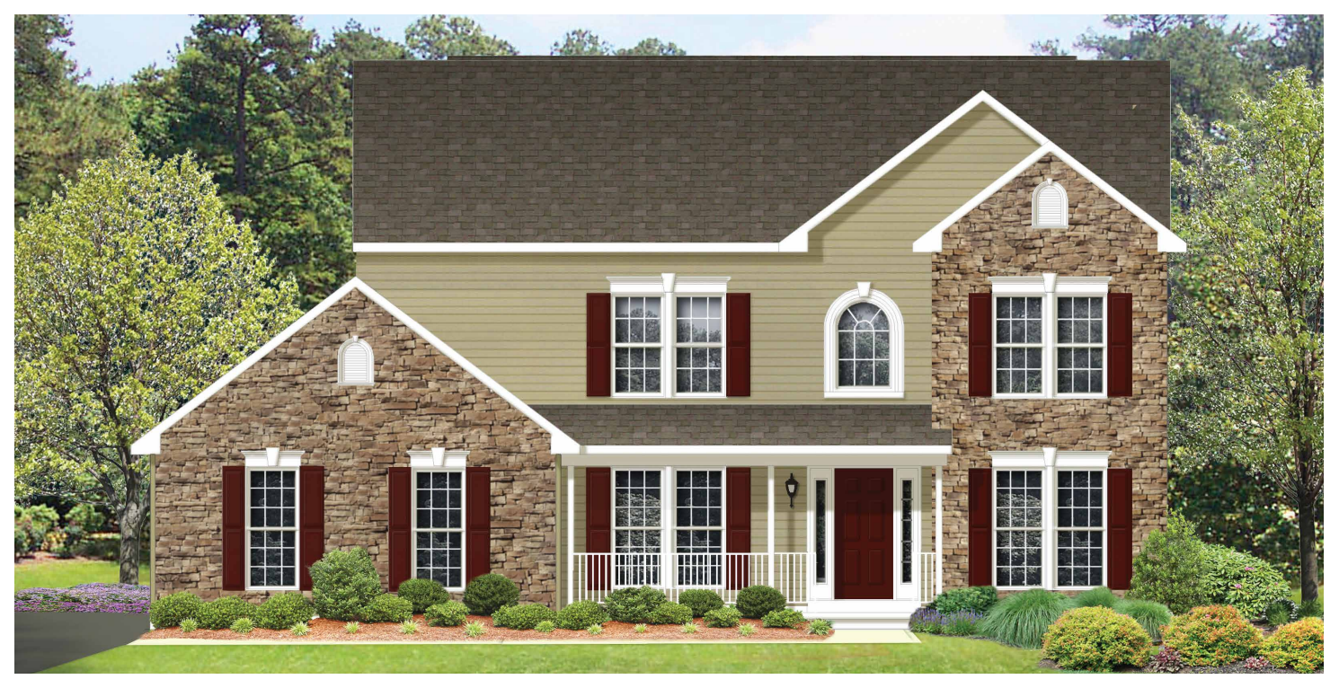
Elevation 3 (Shown with Stone Option and Side Load Garage Option)