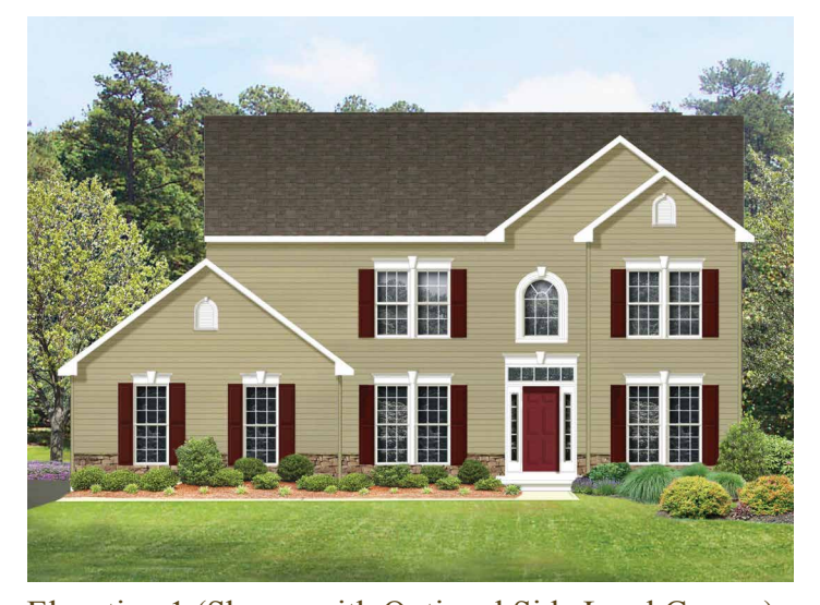
Elevation 1 (Shown with Optional Side Load Garage)