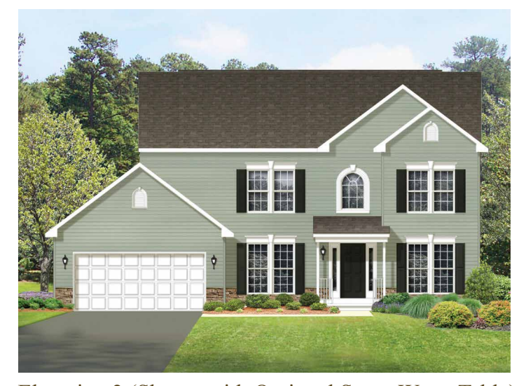
Elevation 2 (Shown with Optional Stone Water Table)