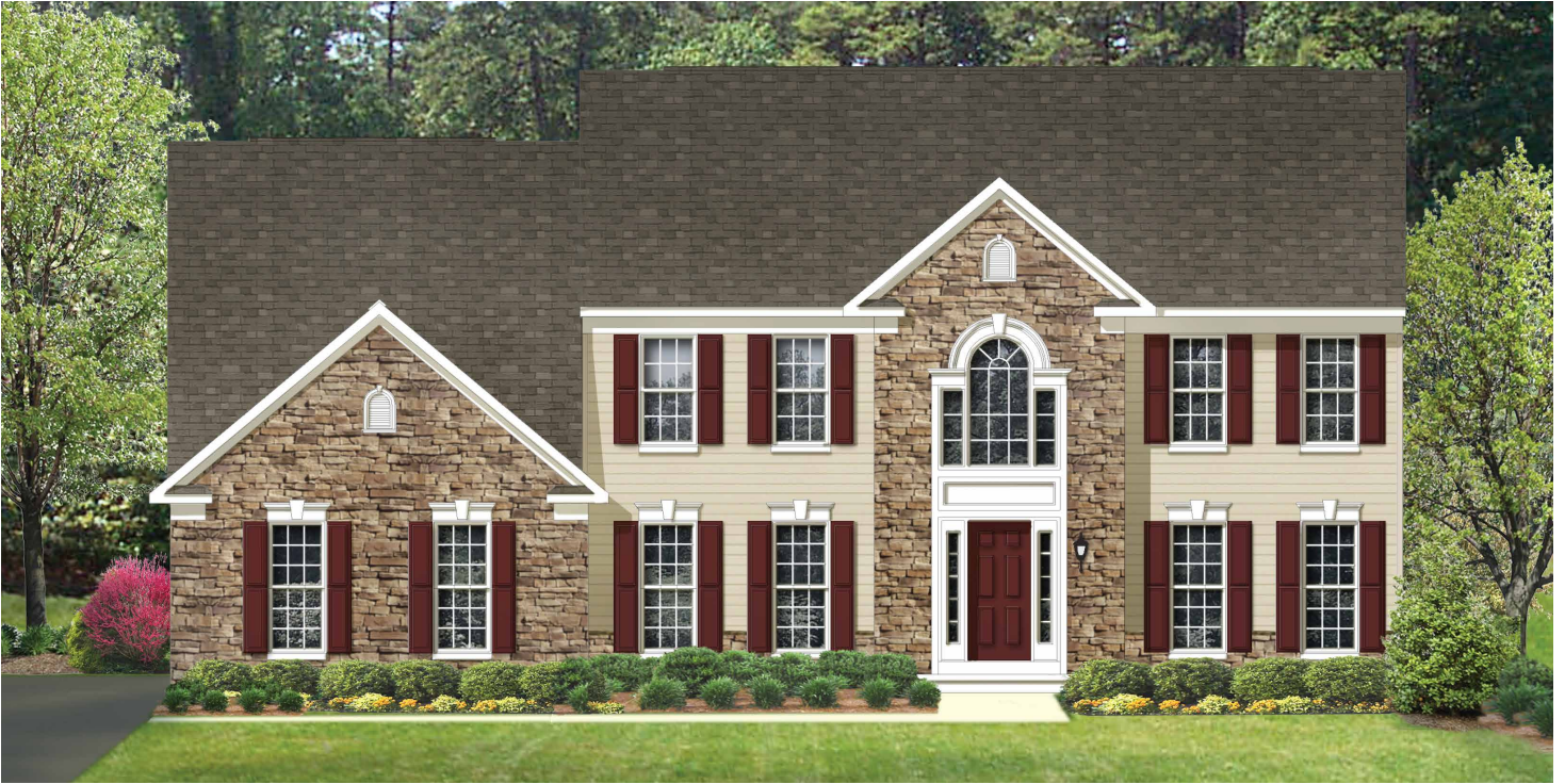
Elevation 1 (Shown with Stone Option and Side Loading Garage Option)