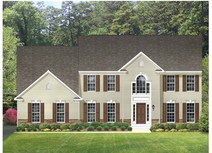
Elevation 3 (Shown with Side Loading Garage Option and Optional Stone Water Table)