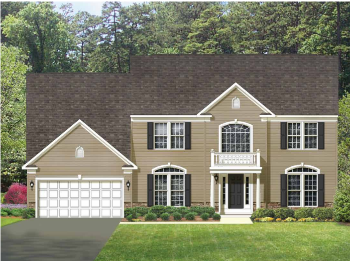
Elevation 2 (Shown with Optional Stone Water Table)