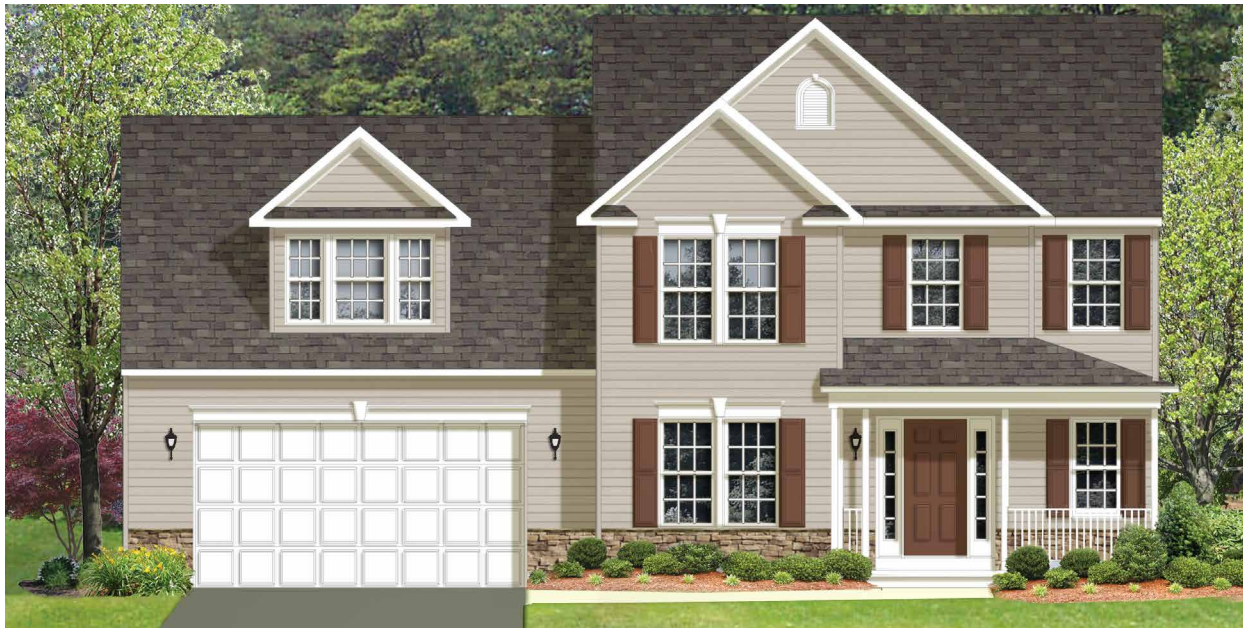
Elevation 1 (Shown with Optional Dormer and Optional Stone Water Table)