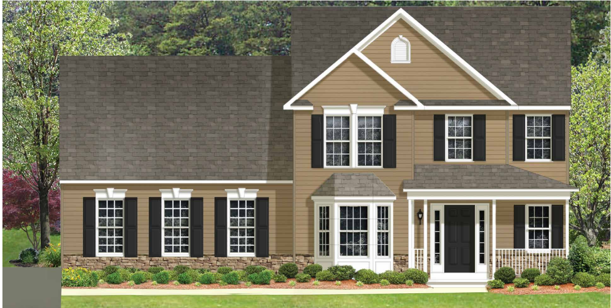
Elevation 3 (Shown with Optional Side Loading Garage, Optional Water Table, & Optional Bay)