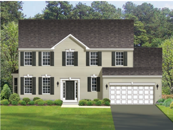
Elevation 2 (Shown with Enhanced Roof Line Option)