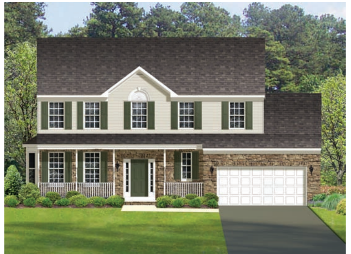
Elevation 3 (Shown with Porch and Stone Option)