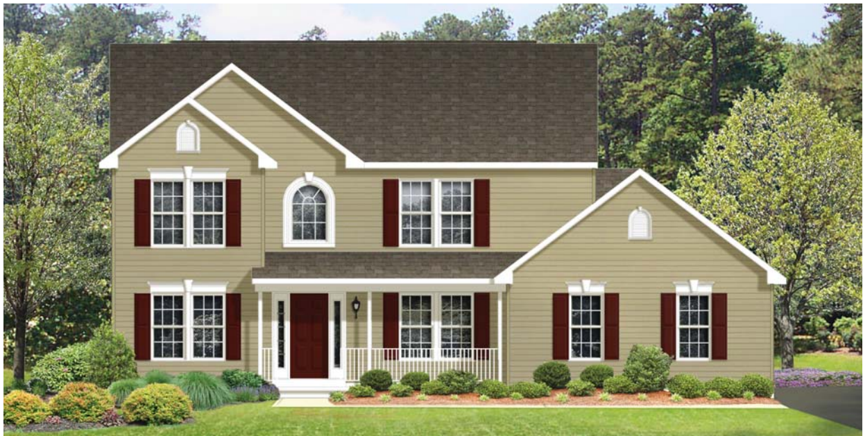
Elevation 3 (Shown with Side Loading Garage Option)