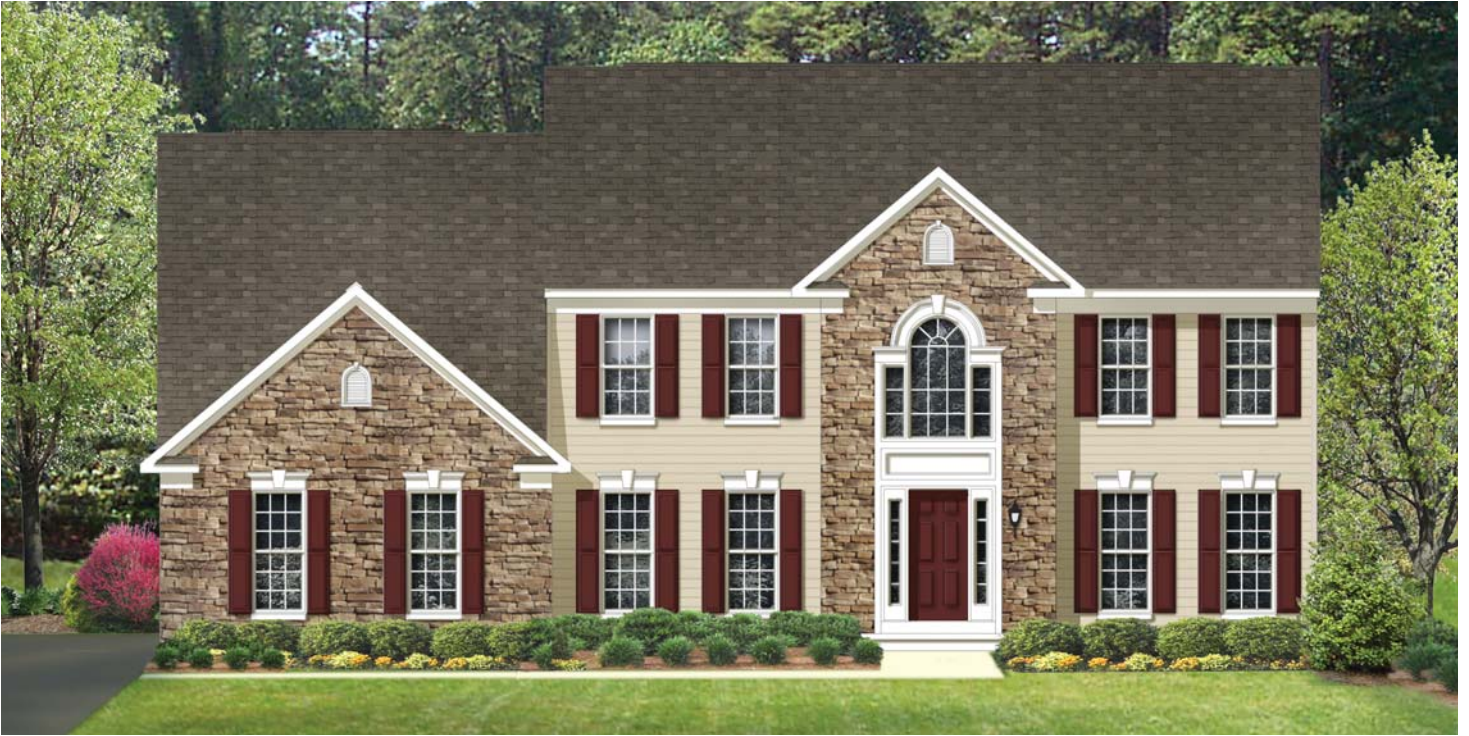
Elevation 1 (Shown with Stone Option and Side Loading Garage Option)