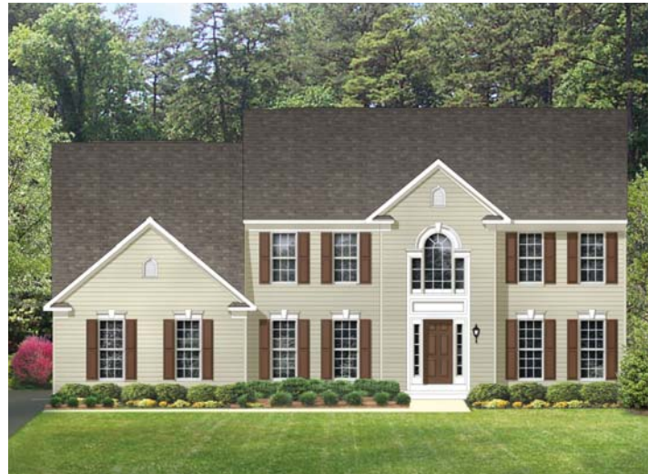
Elevation 3 (Shown with Side Loading Garage Option)